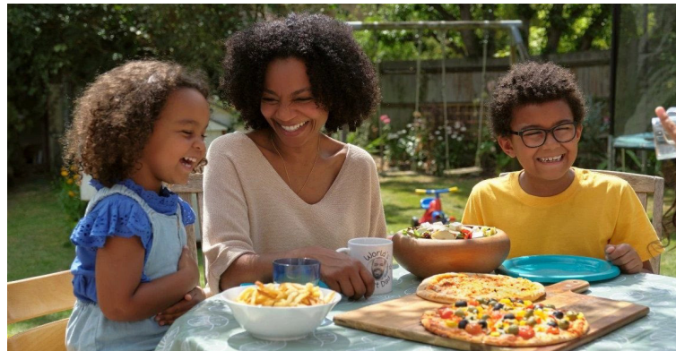
Relevant child definition also applies to Critical Illness Extra.