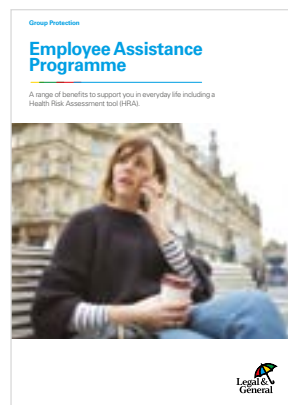
Employee Assistance Programme leaflet