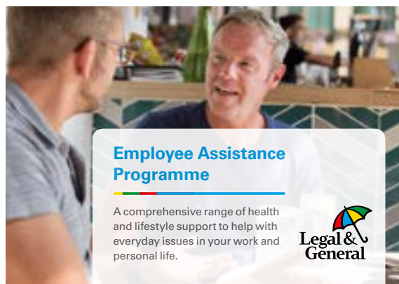
Employee Assistance Programme wallet card