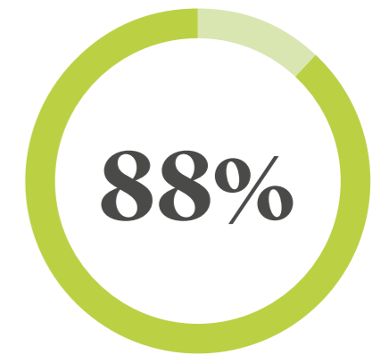
of employees do not feel supported by their employer when it comes to the later life care space*

Staff members affected are usually in the 45-65 age bracket, and at the peak of their working careers. Recognising there could be a big impact upon your wellbeing and your work, your employer has put this support in place. If you found yourself in